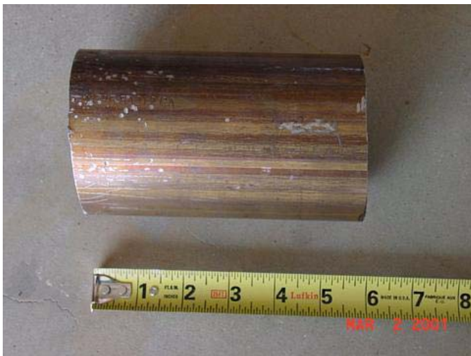
6" section of stock pipe that was cut-off