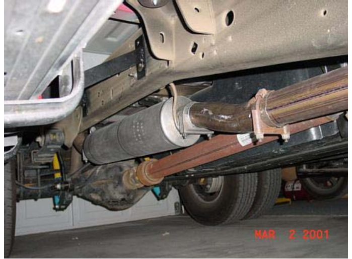
Walker #21470 'Big Truck' muffler installed