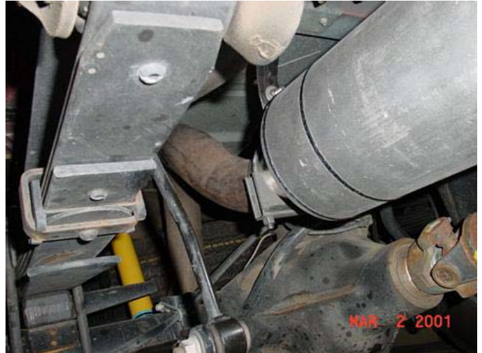
Close up of muffler install, looking back.