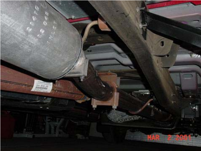
Walker muffler install, looking forward