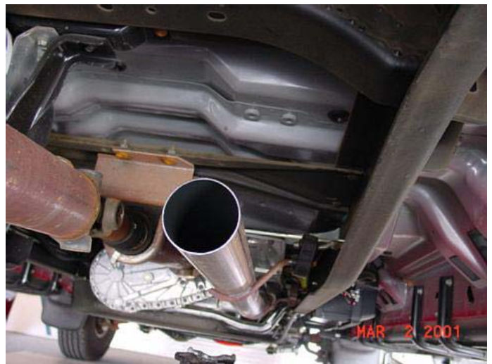
Stock 3.5" diameter exhaust