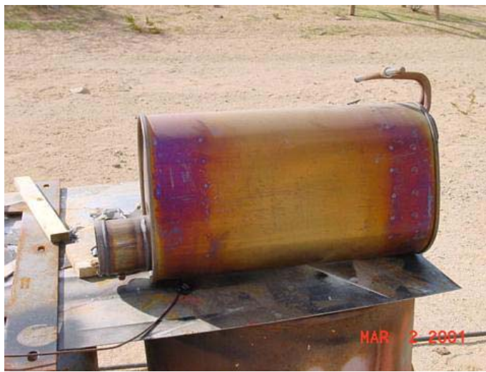
Stock muffer view with inlet on the left. You can see how HOT this muffer got. EGT's have dropped 150F with the Walker muffer.