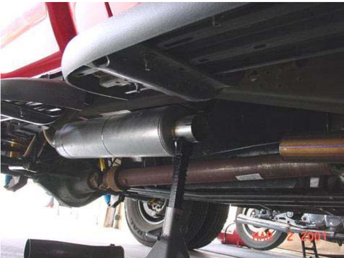
Test Fitting Walker #21470 muffler