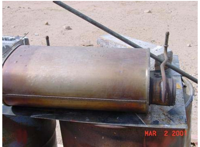
Use standard muffer hanger for rear muffer support details. Stock muffer hanger to be removed and welded to the Walker muffer.