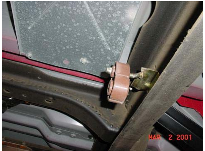
Front mount details, showing the muffler hanger, removed from the stock muffler and welded to the Walker muffler. Also shows the position of the relocated front muffler hanger bracket. The stock front muffler hanger bracket, that was relocated forward, about 12", to support the longer Walker muffler. Use existing bolt hole in the frame.