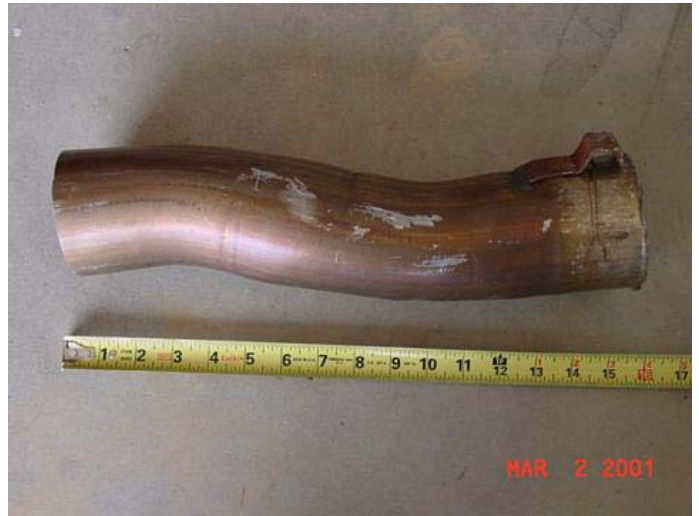
Factory 'S'-bend that was removed and cut.