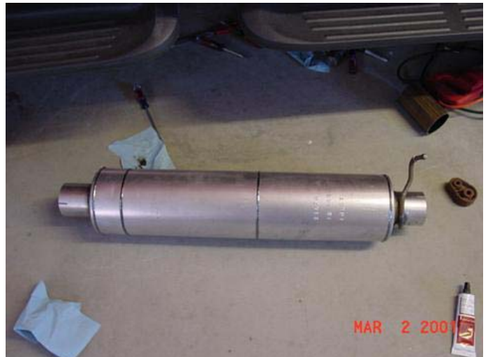
Front muffler hanger welded on (from the stock Ford muffler)